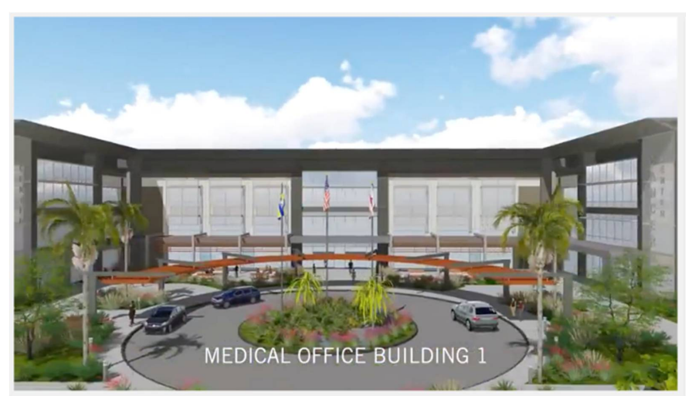
Screen shot of animation for proposed 180,000+ sq. ft. Medical Office Building 1