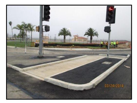
The reconstructed island and access ramps at the MARB main gate at Elsworth Street and Cactus Avenue intersection.

The main gate for March Air Reserve Base (MARB) located at Cactus Avenue and Elsworth Street is now open.