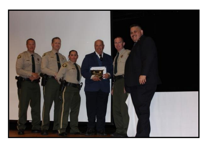
These four honorees donated 3,353 hours to the City of Moreno Valley.