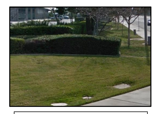
Before – Turf - Southeast corner Frederick St. and Brodiea Ave.

Over 513,000 square feet of water thirsty turf has been replaced with drought tolerant landscaping and drip irrigation. The project was initiated in response to the continuing drought conditions and Eastern Municipal Water District's mandate to reduce potable water use for outdoor irrigation by 70%. The City received a rebate from Metropolitan Water District (MWD) to pay for the cost of the improvements and was under a tight deadline to complete the project. MWD will rebate the City up to $1,026,902 for the project. Completion of the project demonstrates the City's commitment to conserve water, reduce ongoing water expenses and modernizes the public landscaping within its landscape districts.