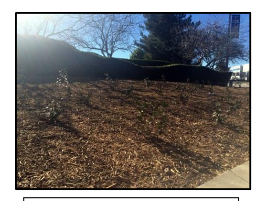
After – Drought tolerant landscaping - Southeast corner Frederick St. and Brodiea Ave.