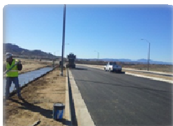
Nason Street under Construction

Construction work for widening of Cactus Avenue from Lasselle Street to Nason Street and extension of Nason Street from Cactus Avenue to Iris Avenue is continuing in full swing with 74% completion. The Cactus/Nason project construction completion is anticipated by June 30, 2013.