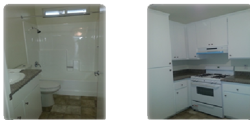
Post-rehabilitation photos of kitchen and bathroom

As of December 19, rehabilitation was 100% complete on four of the 27 units. Three of the completed units are now occupied by income-eligible households that were residents of the property prior to the City's NSP acquisition. The rehabilitation is being completed in phases of 4-units with construction expected to be completed by the end of March 2013. The newly rehabilitated units will be made available to low-income households at or below 50% of the area median income ($33,500 for a family of four). Below are post-rehabilitation photos of a kitchen and bathroom: