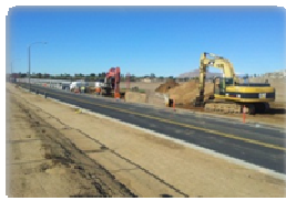
Cactus Avenue under Construction