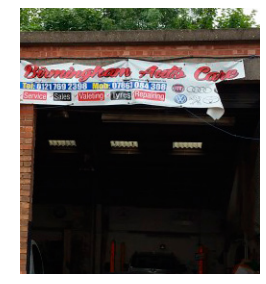
NOT ALLOWED: Ill-maintained banners with signs of deterioration.