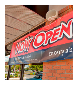
NOT ALLOWED: Banners should not cover or interfere with windows.