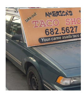
NOT ALLOWED: Signs attached to vehicles or trailers are prohibited.