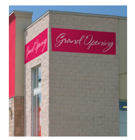
ALLOWED: Well maintained, wall mounted banners. Two banners maximum per elevation.

Written approval from the property owner or authorized agent shall be submitted along with a picture of the building wall occupied by the tenant. Dimensions of the wall(s), height and length of the occupied space, as well the dimensions of the temporary sign at the time of submittal must be submitted.